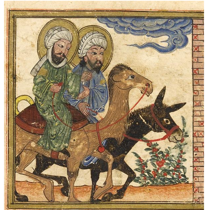
Muhammad and Jesus

First Pillar (Faith): “There is one God (whom the Muslims call Allah) and Muhammad is his Prophet.”