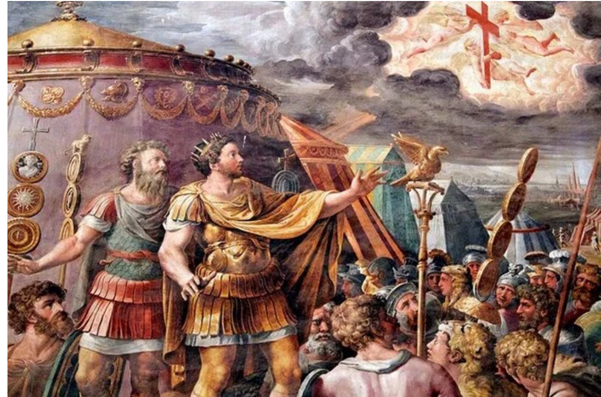
Rafael, c. 1508, Museum of Vatican, Rome, Italy