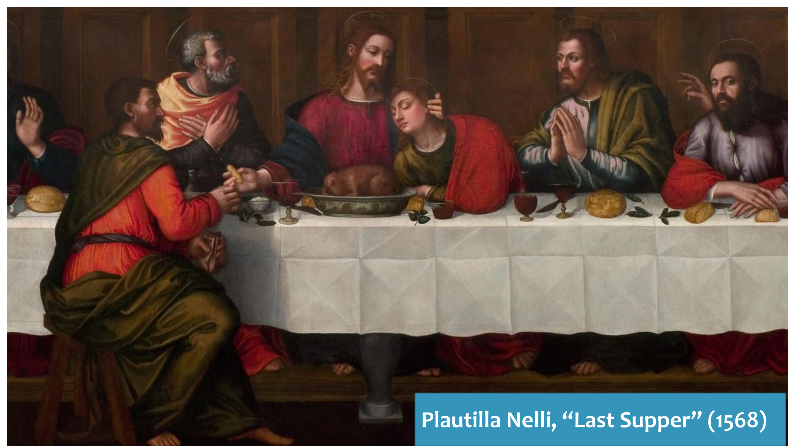
Plautilla Nelli, "Last Supper" (1568)