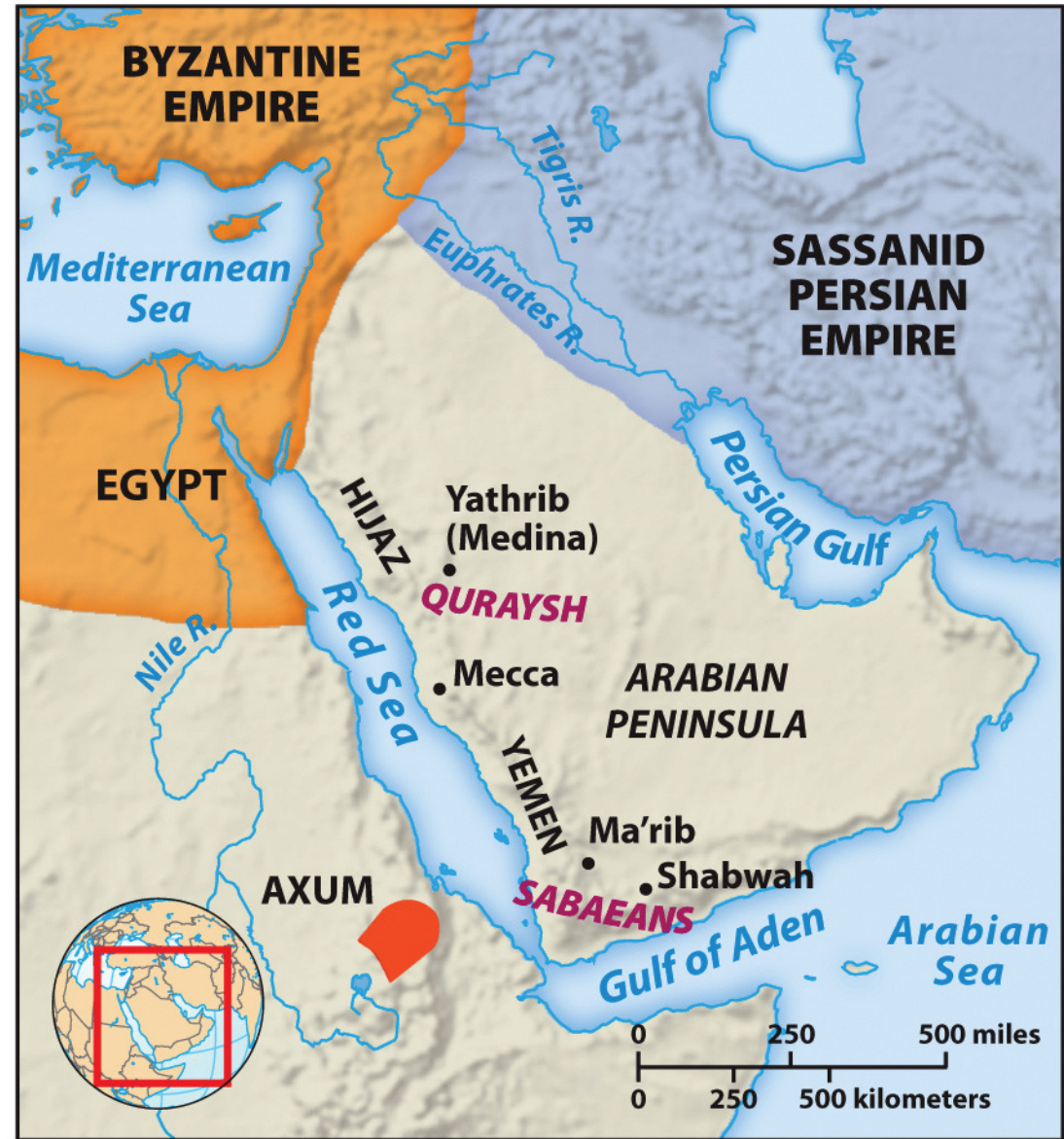
Map 9.1 Arabia at the Time of Muhammad Chapter 9, Ways of the World: A Brief Global History with Sources , Fourth Edition Copyright © 2019 by Bedford/St. Martin's Distributed by Bedford/St. Martin's/Macmillan Learning strictly for use with its products. Not for redistribution.