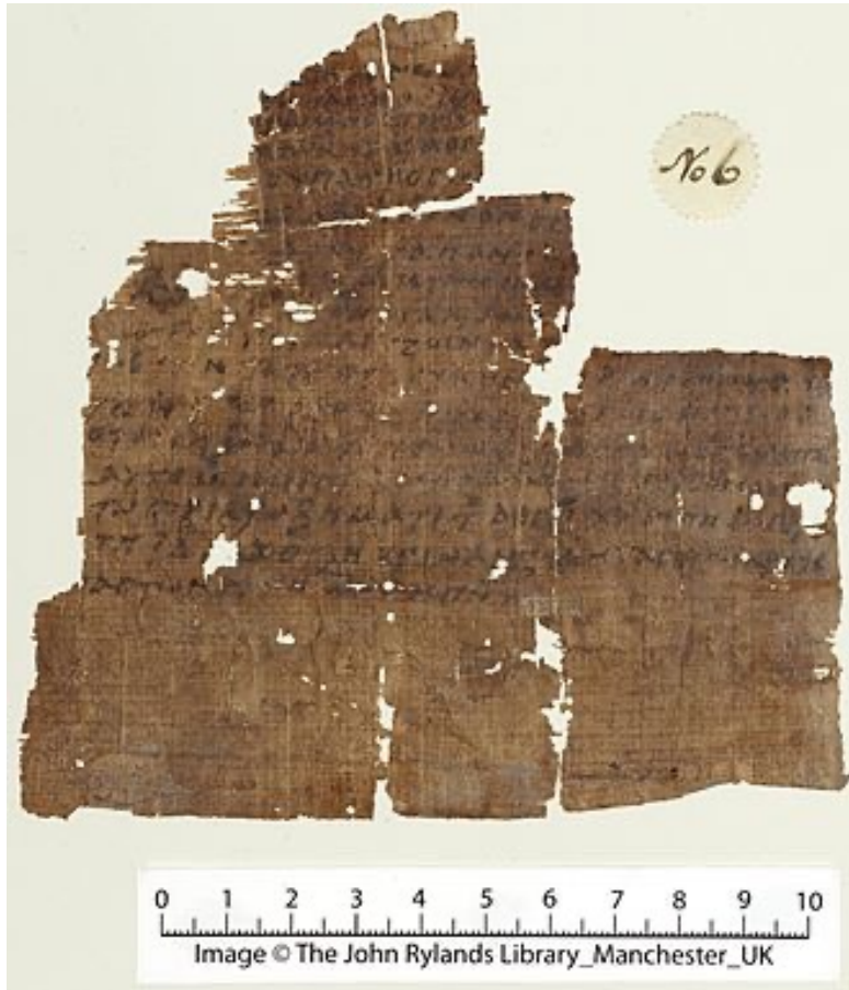
6 th century manuscript of the Nicene Creed