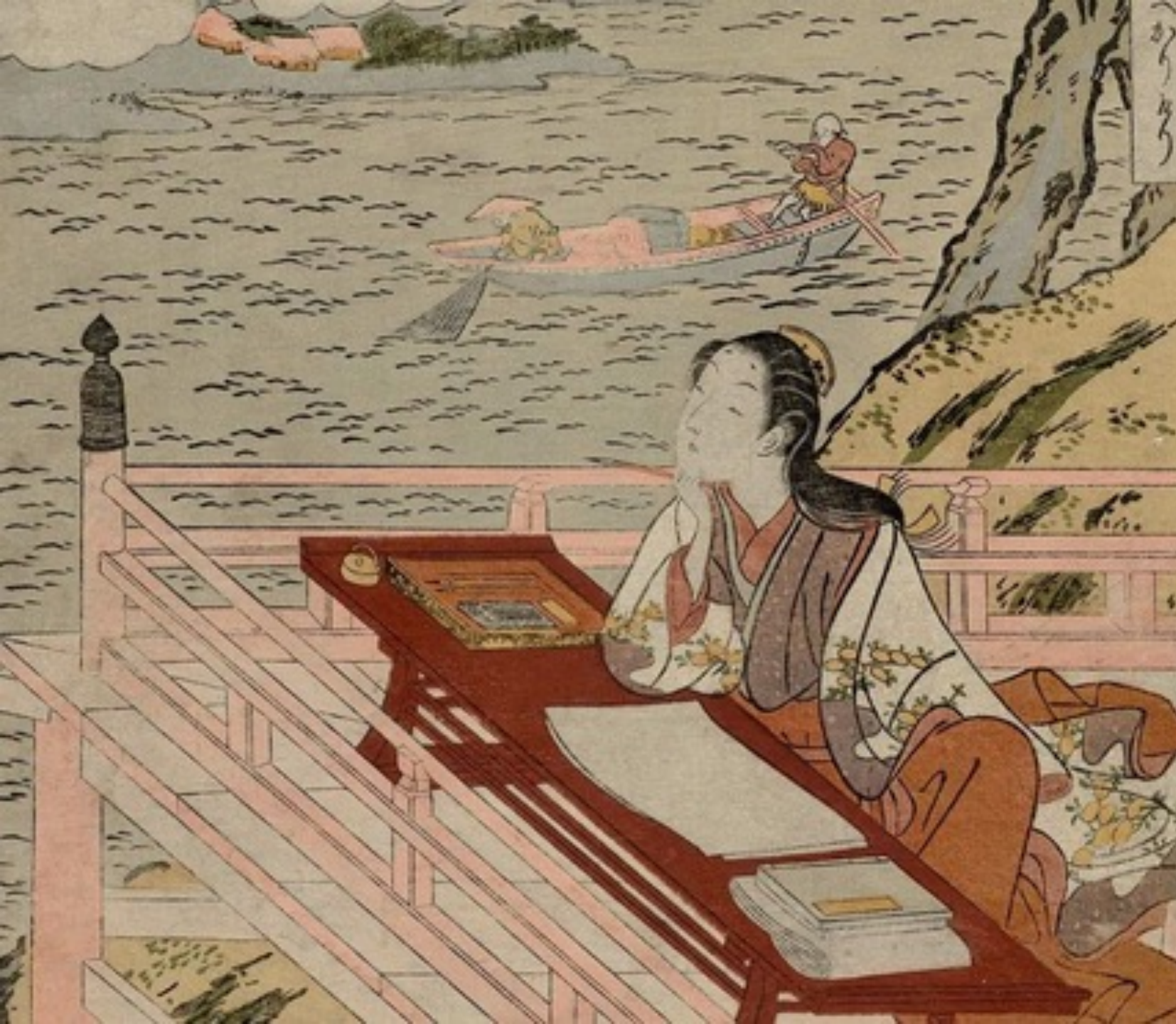
Lady Murasaki Shikibu, The Tale of Genji (1000 C.E.)